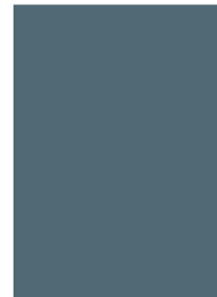
14 | Slate Blue