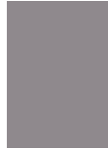
42 | Stone Gray